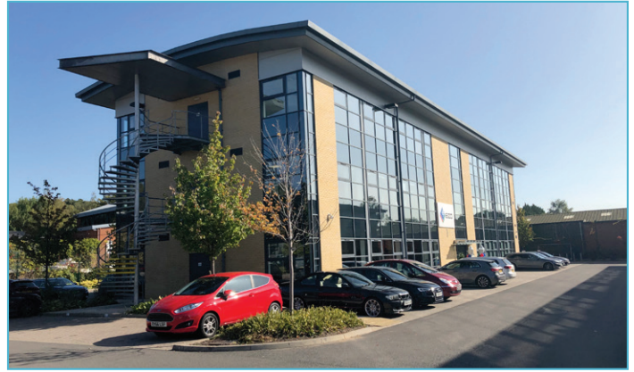
EIZO's new UK office houses a contemporary display wall enabled by Matrox video-wall technology.