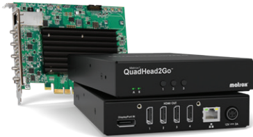
Matrox QuadHead2Go multi-monitor controllers

Matrox QuadHead2Go multi-monitor controllers drive a 12-monitor creative video wall that enlivens EIZO's reception area