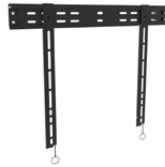
Fixed 800 VESA VDM-800-F-LP