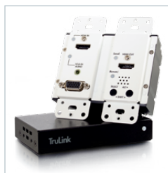
C2G® Amplifier (40880), HDBaseT, HDMI Products