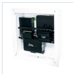
Proximity Series In-Wall Box