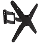
400 VESA VDM-400-M