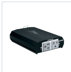
Select Series PDU with RackLink™: RLNK-215