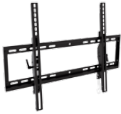
Tilt 600 VESA VDM-600-T