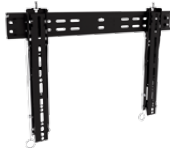
Tilt 600 VESA VDM-600-T-LP