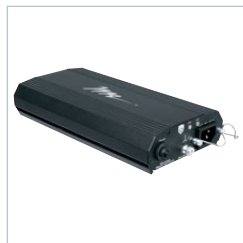
Compact surge: PD-215, PD-28-SP