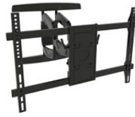
600 VESA VDM600-M