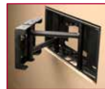
Perfect for in-wall or recessed applications