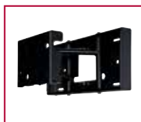
Dedicated Models (SP850 shown)