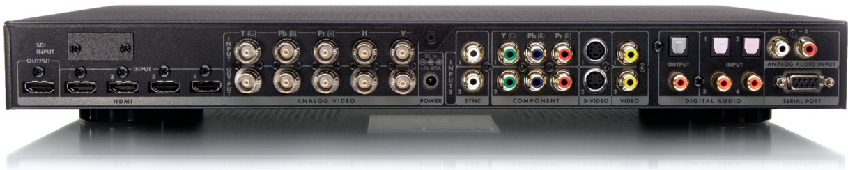
Rear Panel of the DVDO iScan VP30