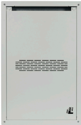
The front cover panel for the IWB Series box has a cable exit and vents.