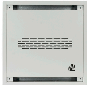
The front cover panel for the IWBK-1414 box has 2 cable exits and vents.