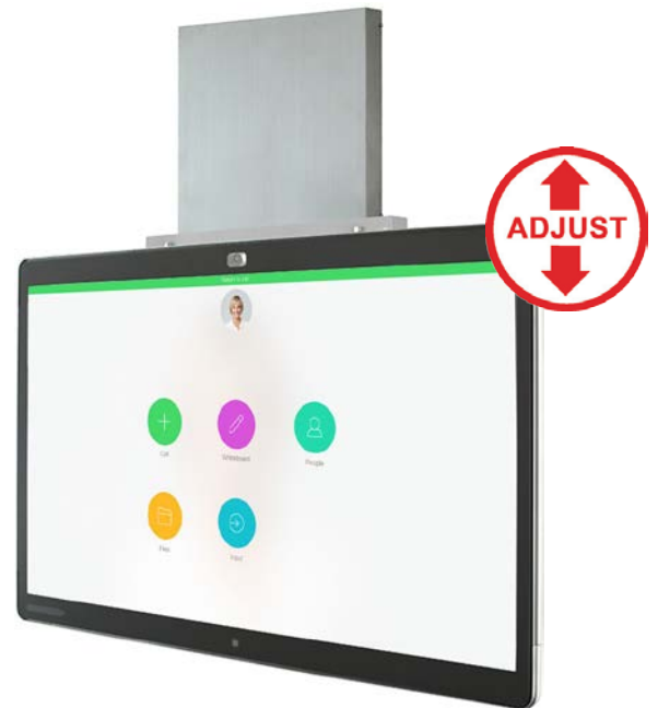
Shown the 55" Cisco Webex Board