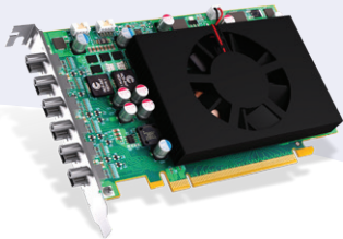
Matrox C680 P/N: C680-E2GBF