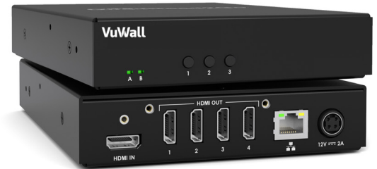
AdScape 4K Expander

Plug and play with default output arrangement of 2x2 set for the most common scenarios. Output arrangement can be set from the front panel to additional simple arrangements: 2x1, 1x2, 2x2, 3x1, 1x3, 4x1, 1x4 in both portrait and landscape. Manage multiple Adscape units over the network with the AdScape Configurator software to customize output arrangements in mixed resolutions and bezel management.