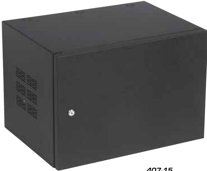
407-15 w/ Optional Front Door