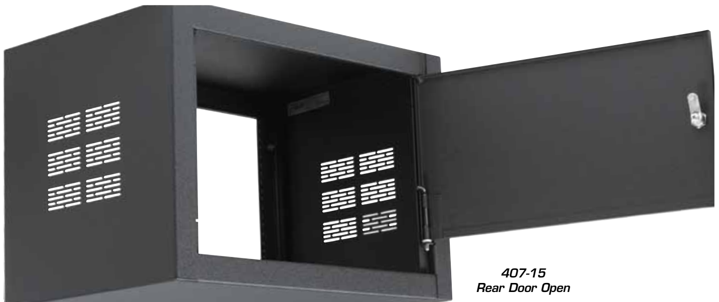
407-15 Rear Door Open