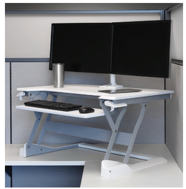
SHOWN WITH WORKFIT-TL SIT-STAND WORKSTATION

THE LOW-PROFILE MONITOR CROSS-BAR PROVIDES A COMPACT RANGE OF MOTION