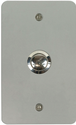
Call switch with heavy duty wall plate. Choice of standard silver button (#CSV) or red oversized "mushroom" button (#CSV-M).