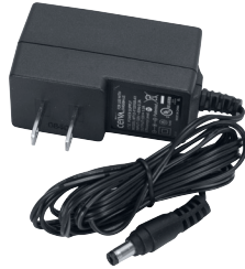
Includes power supply

Steel panel with dual blower fans is made to replace a rear knockout panel in select Lowell racks. Air is pulled in from top/bottom fans, then blown out through front vents. Includes power supply.