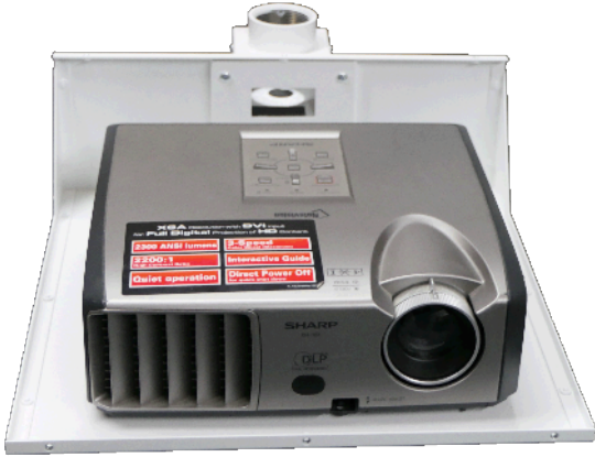
Projector Shelf Mounted to a 1-1/2" dia Pole