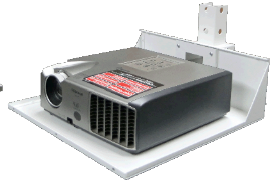
Projector Shelf Mounted to Unistrut®

A Flexible Design with every inch of space useable in two different versions: Attachment to a 1 1/2" Pole or to Unistrut® making it very easy to incorporate into any installation