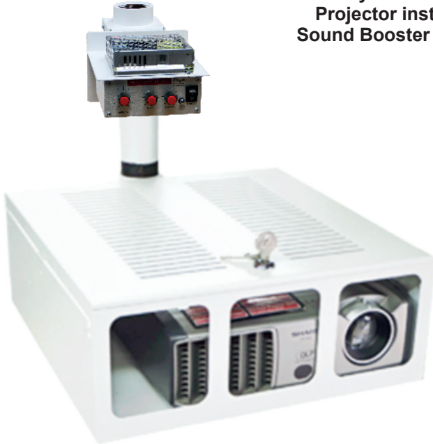
Shown with our new Optional Pole Mounted 60 Watt Projector Sound Booster Amplifier

When you need more sound from the Projector install our new Projector Sound Booster on the Projector's Pole