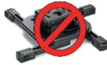
Does not require a Projector Mount