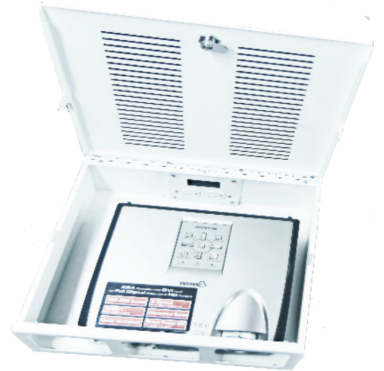
By unlocking the Hinged Top Panel the User has immediate access to the Interior