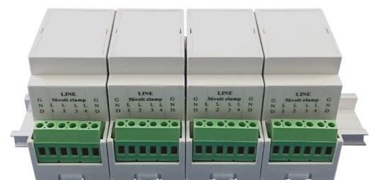
Sample picture of four TPD-AmpPro which protects 8 channels/outdoor speaker leads to amplifier.