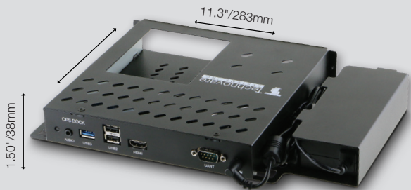
*OPS-DOCK is an accessory and is not included with any version of the OPS-PCAEQ.