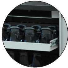
PULL OUT DRAWER FOR EASY DEPLOYMENT