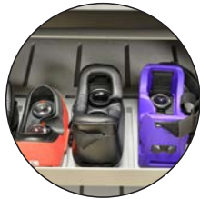
FITS MOST GOGGLES ON MARKET