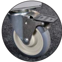
BALLOON WHEELS CUSHIONS DEVICES WHEN MOVING